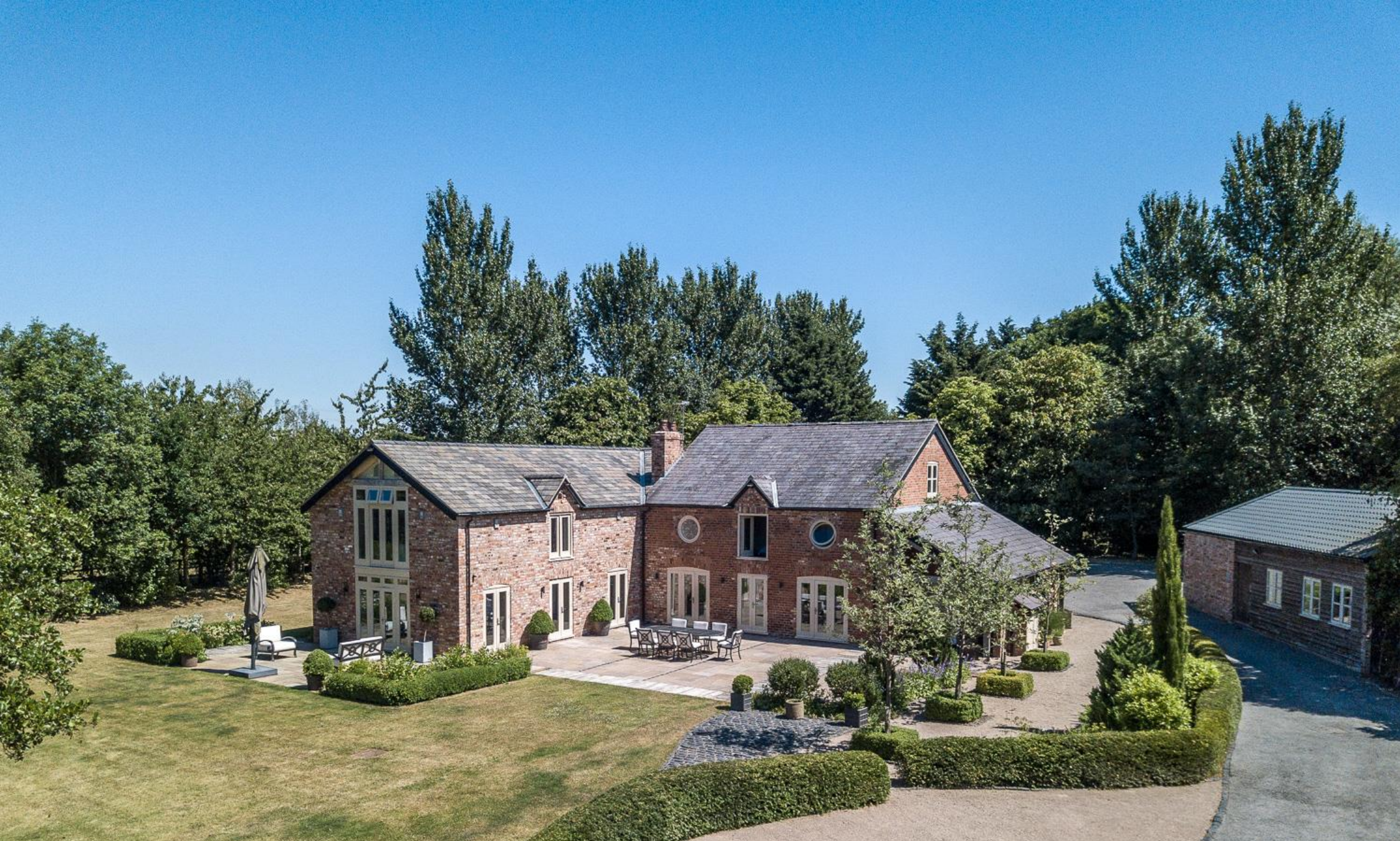
The Sugar House Manley, Cheshire